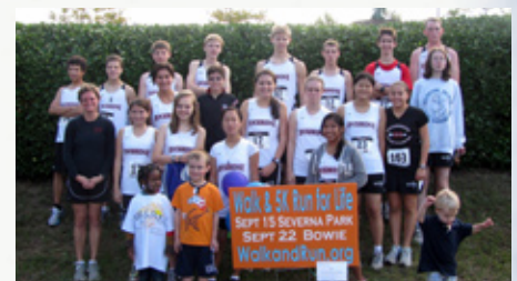
Rockbridge Academy Cross Country (and friends)